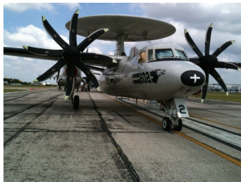
Cowtown Warbird Roundup 2010

In order to open to the public, the museum needs Visitor Guides. Guides will present the museum's collection, stories and experiences. The three goals of the museum are preservation, inspiration and education, so the only real requirement to be a guide is a willingness to serve. For more information about the museum or to become a guide, please call 800-575-0535 or visit www.facmuseum.org .