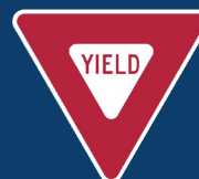
Yield to all traffic in the roundabout.