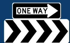
Roundabout traffic travels one-way.