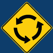
Roundabout ahead, slow down.

As you get closer to the roundabout entrance, it is very important to observe the signs and arrows to determine which lane to use before entering a roundabout. Signs above the road and white arrows on the road will show the correct lane to use.