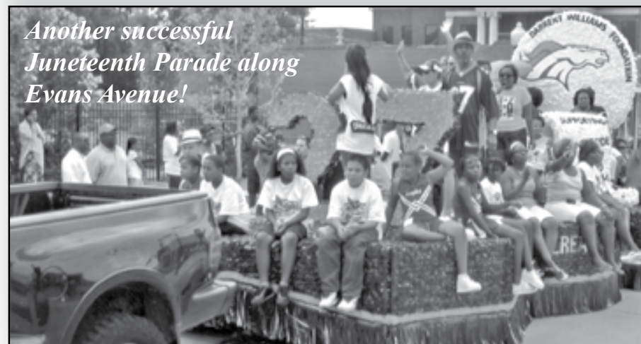
Another successful Juneteenth Parade along Evans Avenue!