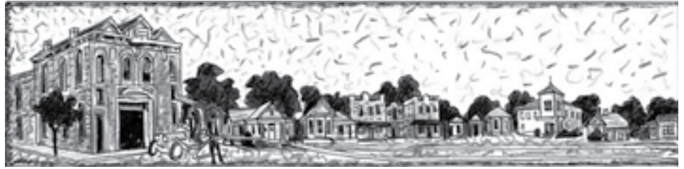
Rendering of public art mural to be installed on facade of new fire station on Evans Street in District 8.

The FWPA program started with a commitment from City Council to allocate 2 percent of the total cost of future bond programs for public art. The 2004 CIP generated more than $4 million for public art and design enhancements associated with capital projects. The 2008 bond program recently approved by voters earmarks another $3 million