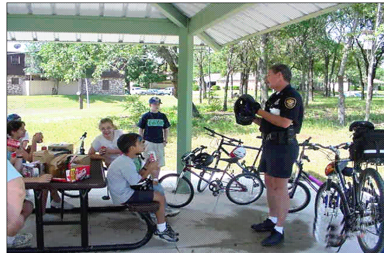
Neighborhood Police Officers meet with community organizations on a variety of issues, such as bicycle safety.