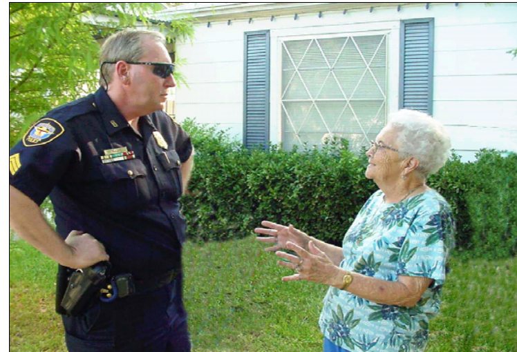
Neighborhood Police Officers (NPO) often advise residents on home safety issues.