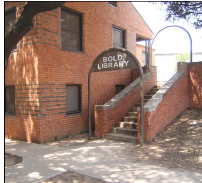
The Butler community has an on-site satellite library that opened in 1997 and is open five days a week.