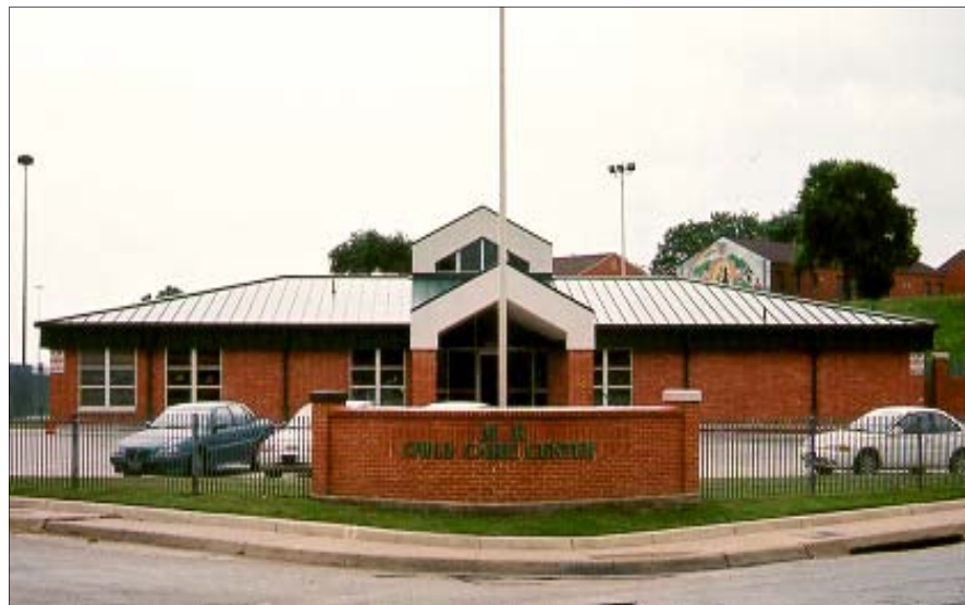
The AMAKA Child Care Center at 1501 Stephenson Street is located within Butler Place. It has the capacity to provide child care for 100 children.