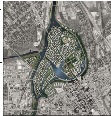
Trinity Uptown Plan