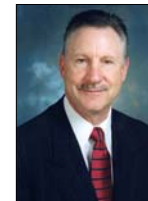
Mike Moncrief Mayor