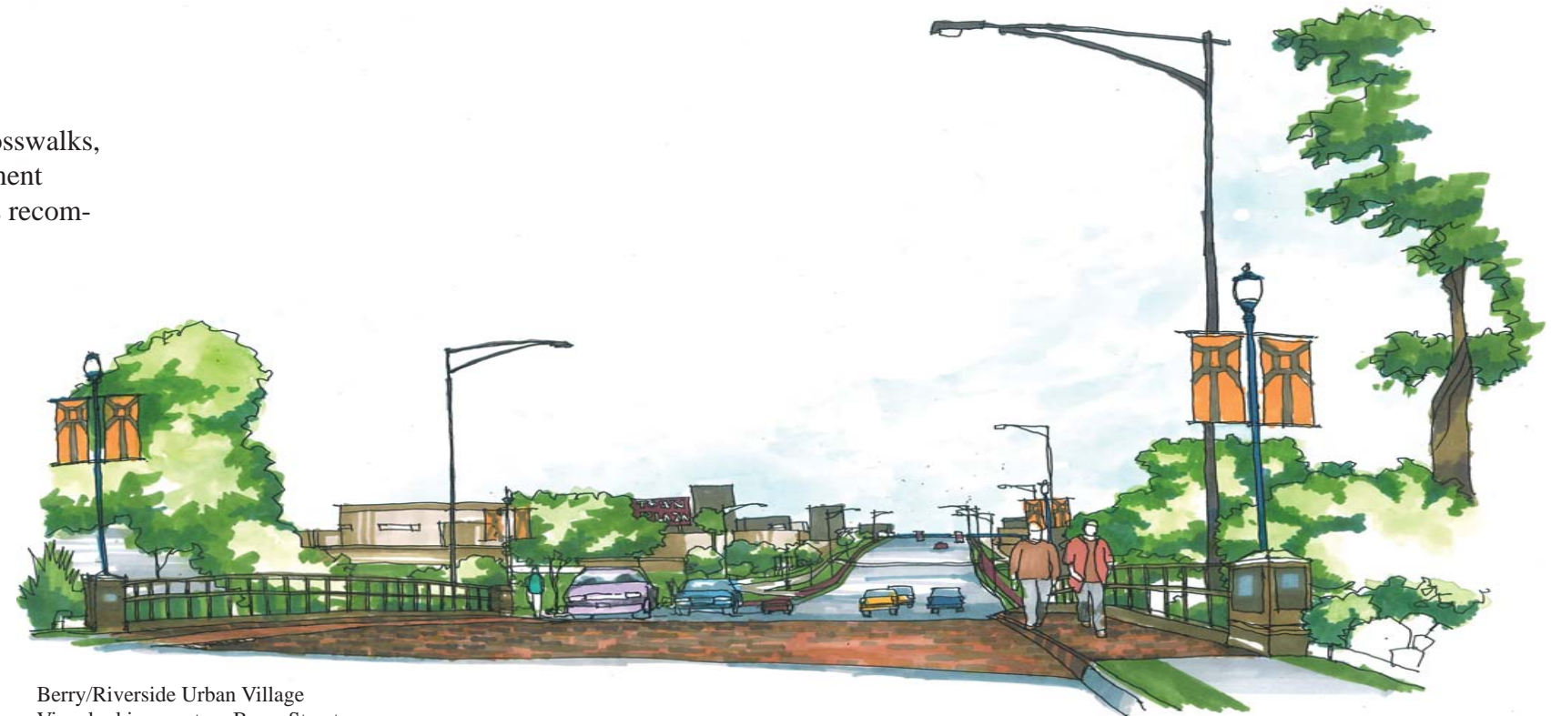
Berry/Riverside Urban Village View looking west on Berry Street