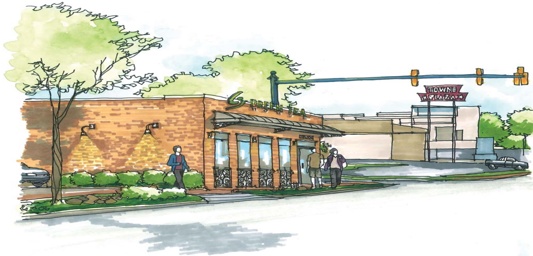
Doc's Auto Insurance Building View of southeast corner of Berry Street and Riverside Drive