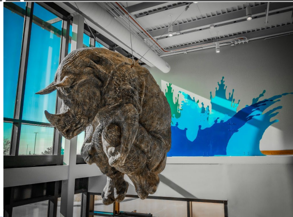
CannonBall!!!, Oklahoma Zoo and Botanical Garden, Oklahoma City, OK