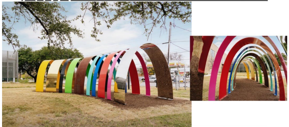
Everywhen, Austin, Texas, 2020