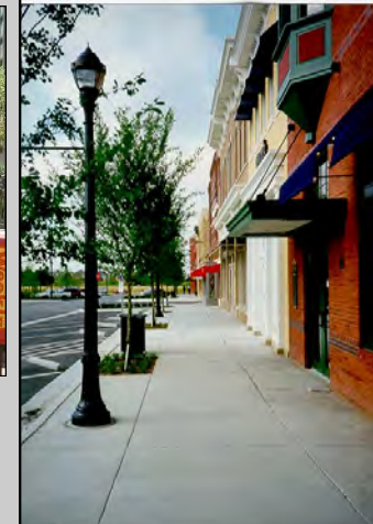
The Pedestrian Way serves as the area dedicated to walking and shall be kept clear of all fixtures and obstructions.