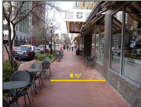
Sidewalks in Downtown Fort Worth have different widths.