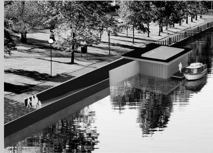
Conceptual water taxi stop