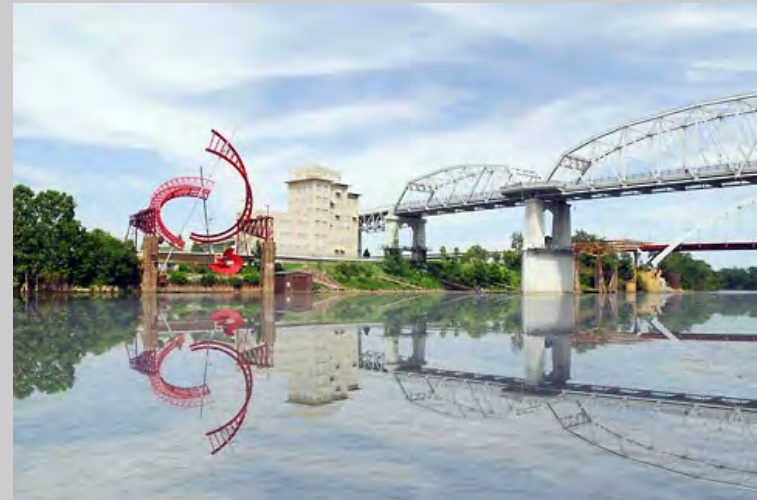
Ghost Ballet. Riverfront Park Nashville, Tennessee.