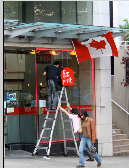
Awnings/canopies can announce primary Entrances.