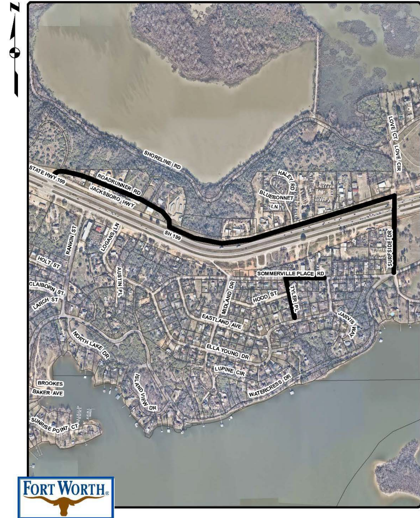
Lakeside Area Water and Sewer Improvements