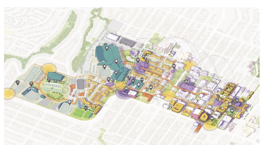
CAMPUS + RESIDENTIAL LIFE