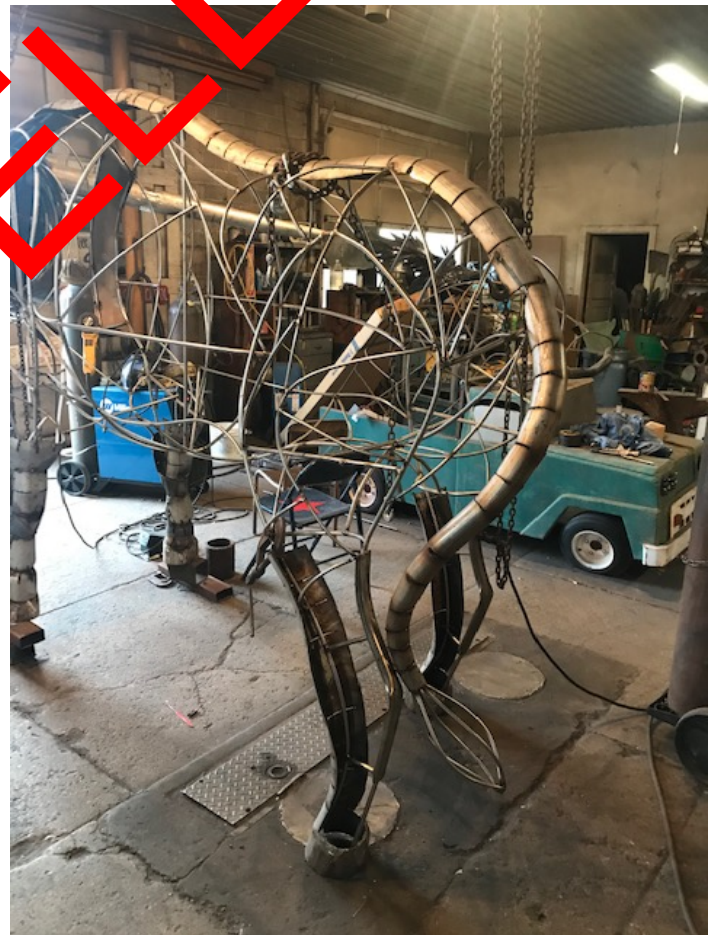
Left: Detail of shaped features including facial components and legs as well as placed horns (to be shaped).